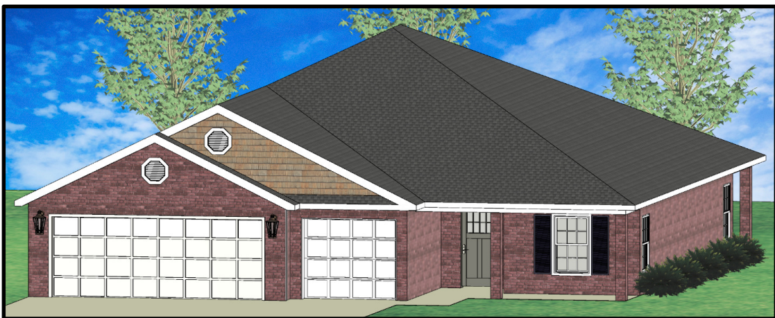
FRONT ELEVATION - OPTION "C"