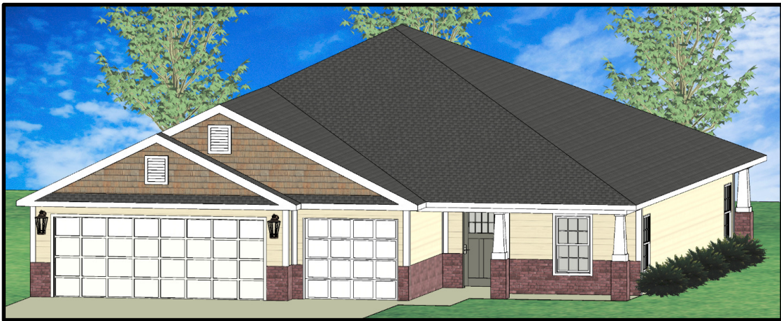
FRONT ELEVATION - OPTION "B"