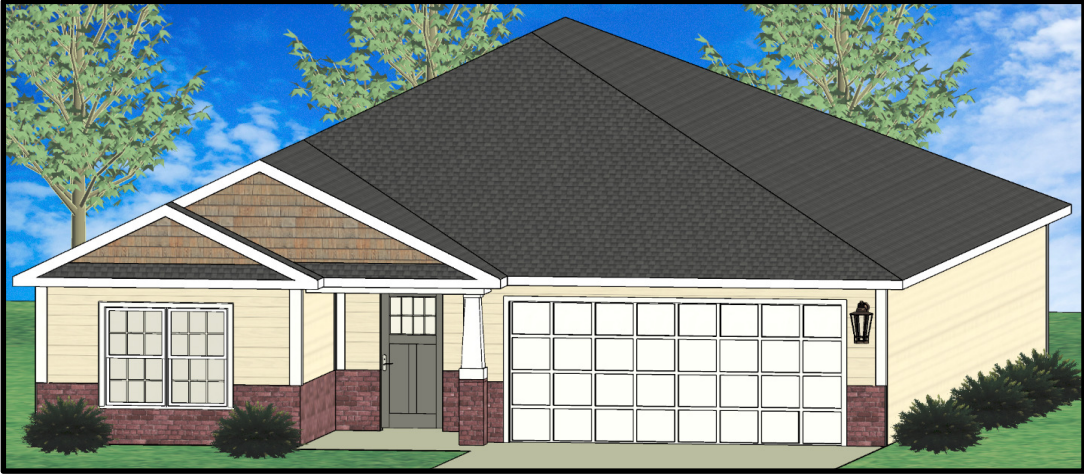
FRONT ELEVATION - OPTION "B"