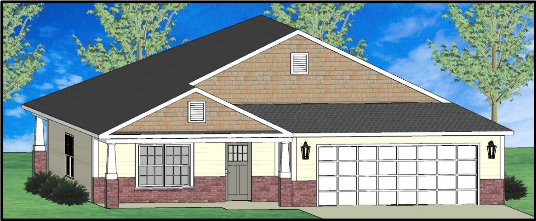
FRONT ELEVATION - OPTION "B"