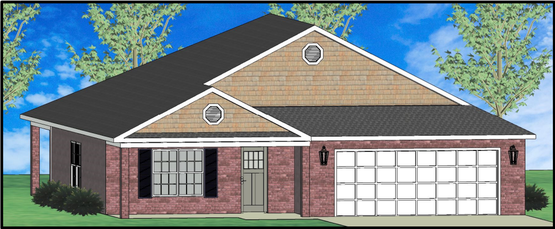
FRONT ELEVATION - OPTION "C"