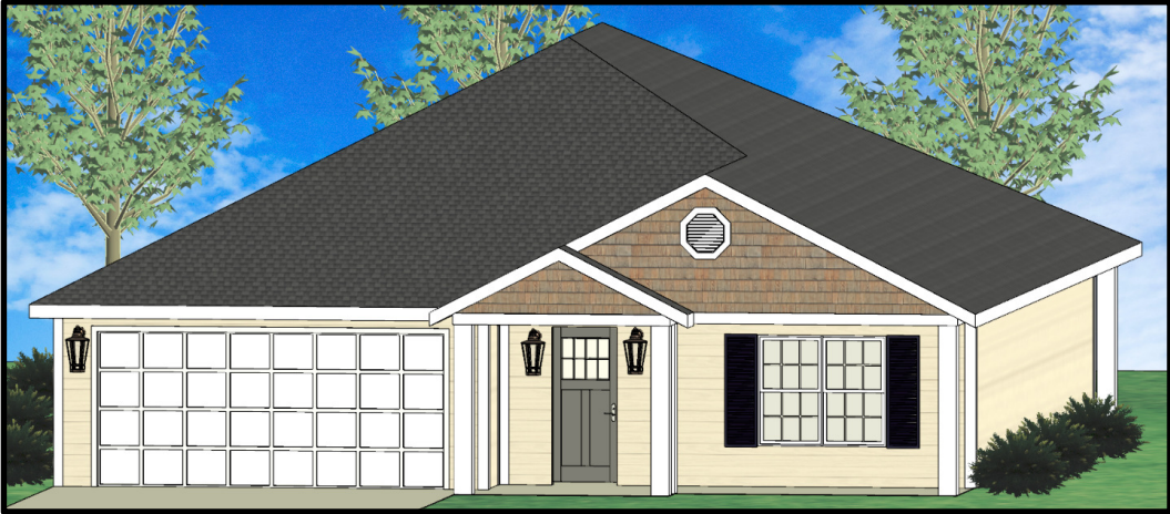
FRONT ELEVATION – OPTION “A”

OPTION A - ALL SIDING • OPTION B - WAINSCOT • OPTION C - BRICK FACE