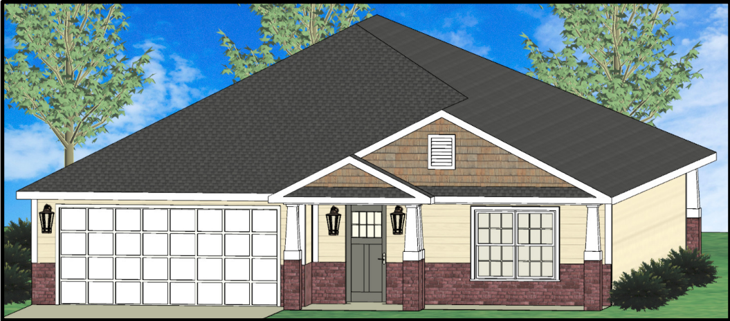
FRONT ELEVATION – OPTION “B”