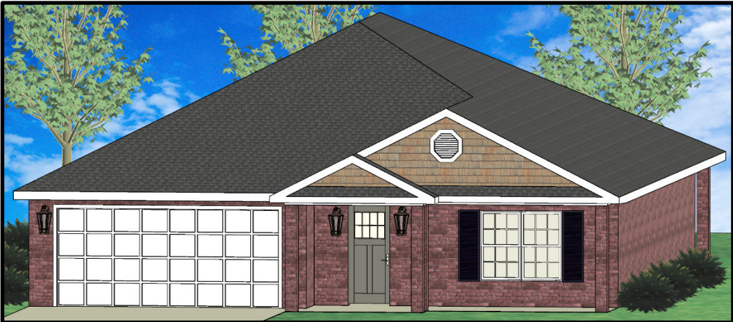
FRONT ELEVATION – OPTION “C”