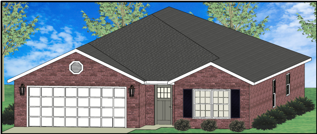
FRONT ELEVATION – OPTION “C”