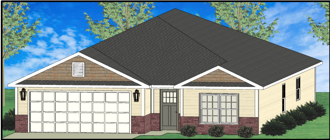
FRONT ELEVATION – OPTION “B”