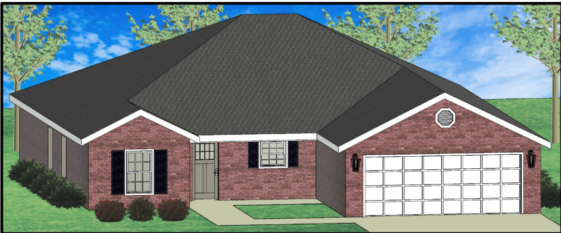
FRONT ELEVATION - OPTION "C"