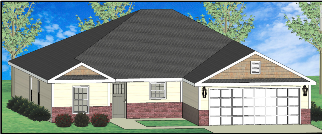
FRONT ELEVATION - OPTION "B"