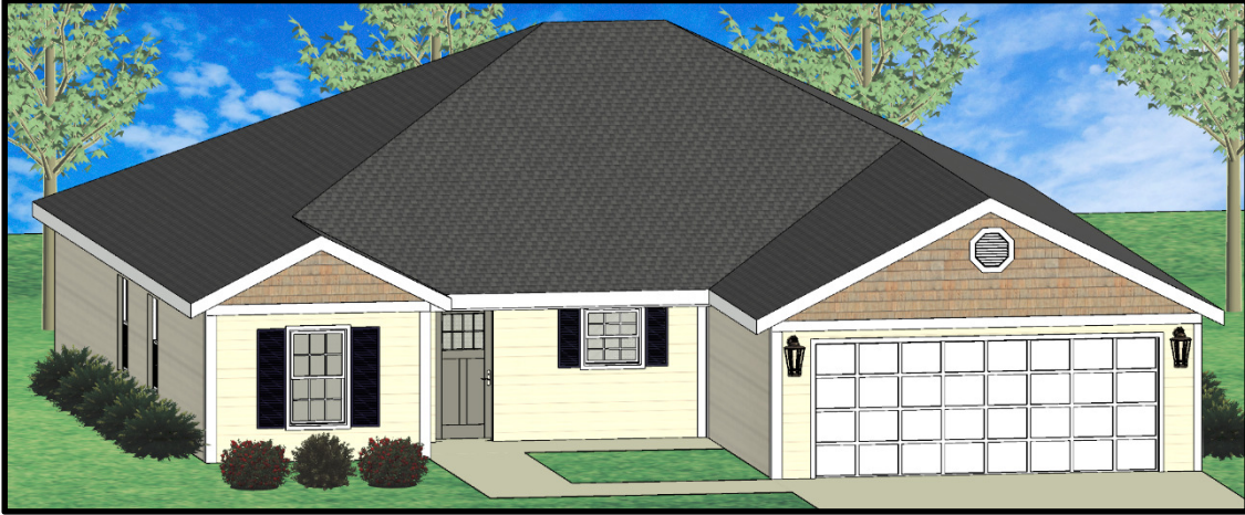
FRONT ELEVATION - OPTION "A"

OPTION A - ALL SIDING • OPTION B - WAINSCOT • OPTION C - BRICK FACE