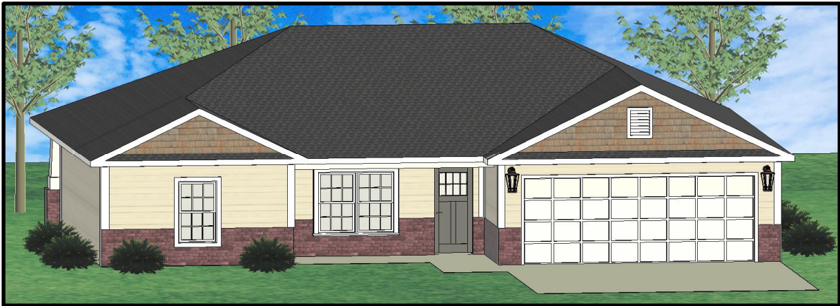
FRONT ELEVATION – OPTION “B”