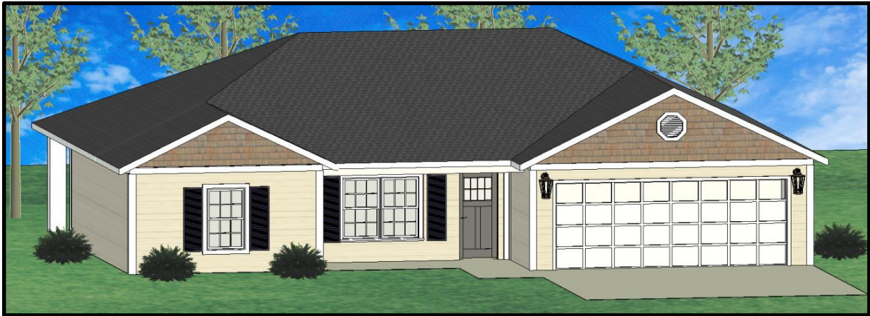
FRONT ELEVATION – OPTION “A”

OPTION A - ALL SIDING • OPTION B - WAINSCOT • OPTION C - BRICK FACE