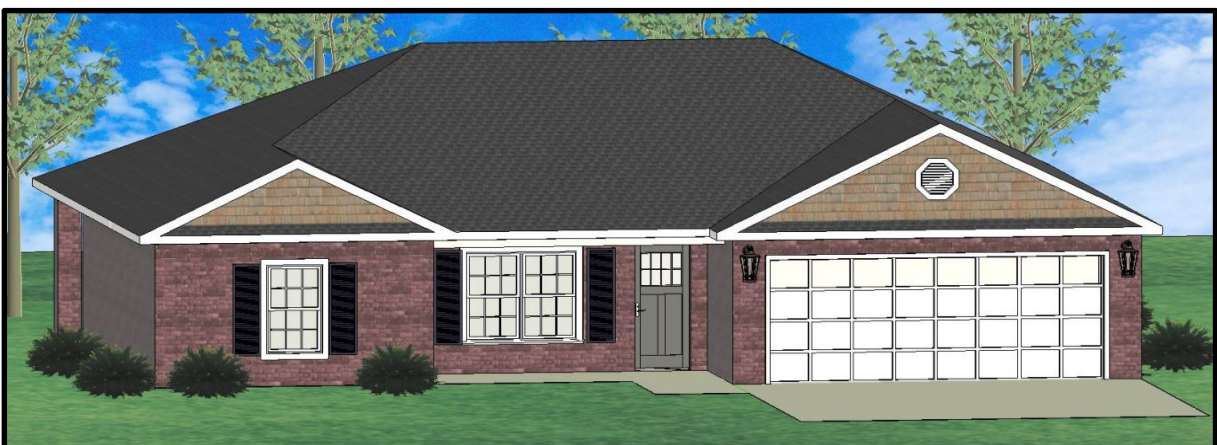
FRONT ELEVATION – OPTION “C”