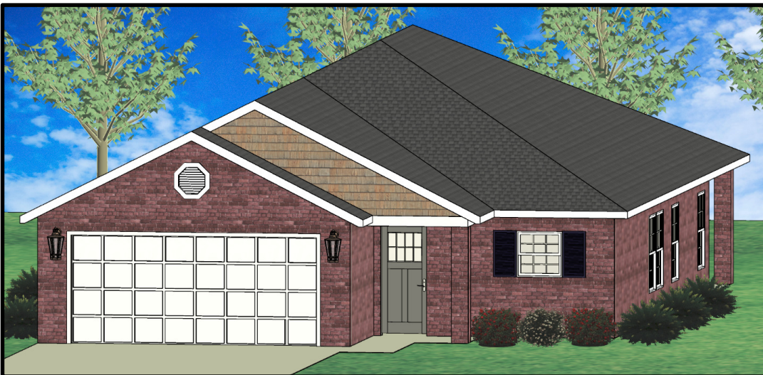
FRONT ELEVATION - OPTION "C"