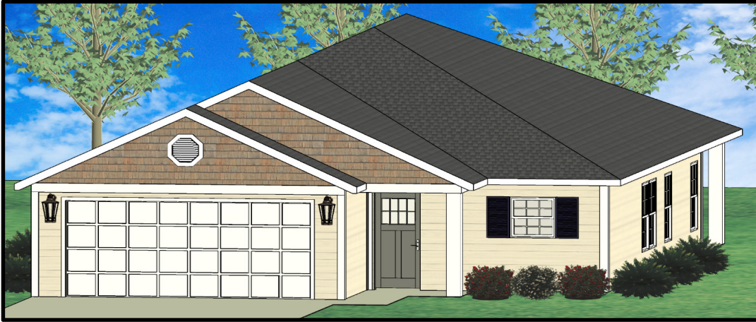
FRONT ELEVATION - OPTION "A"

OPTION A - ALL SIDING • OPTION B - WAINSCOT • OPTION C - BRICK FACE