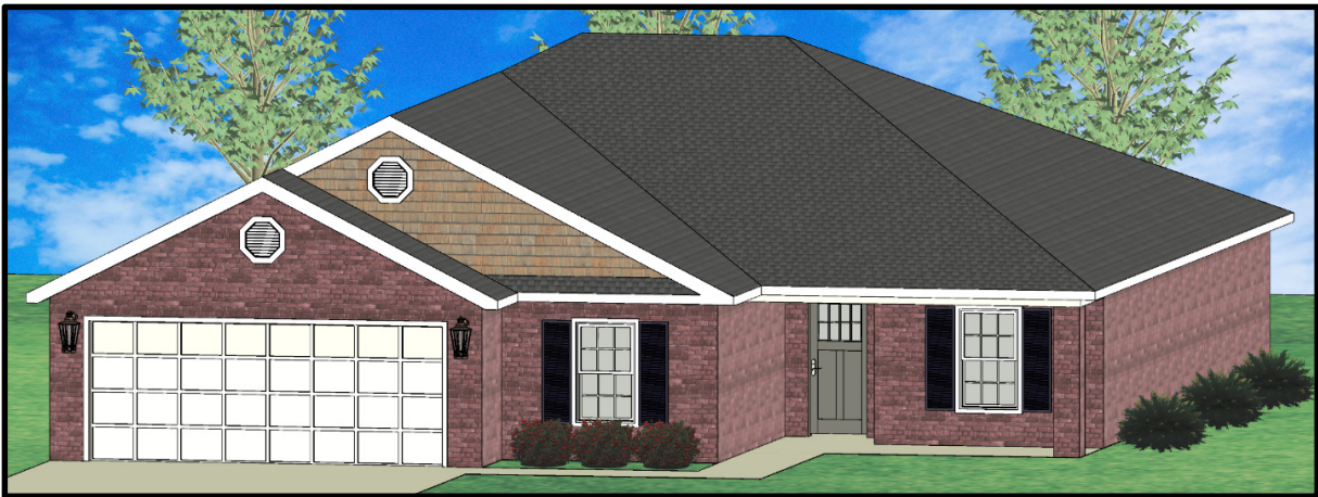
FRONT ELEVATION – OPTION “C”