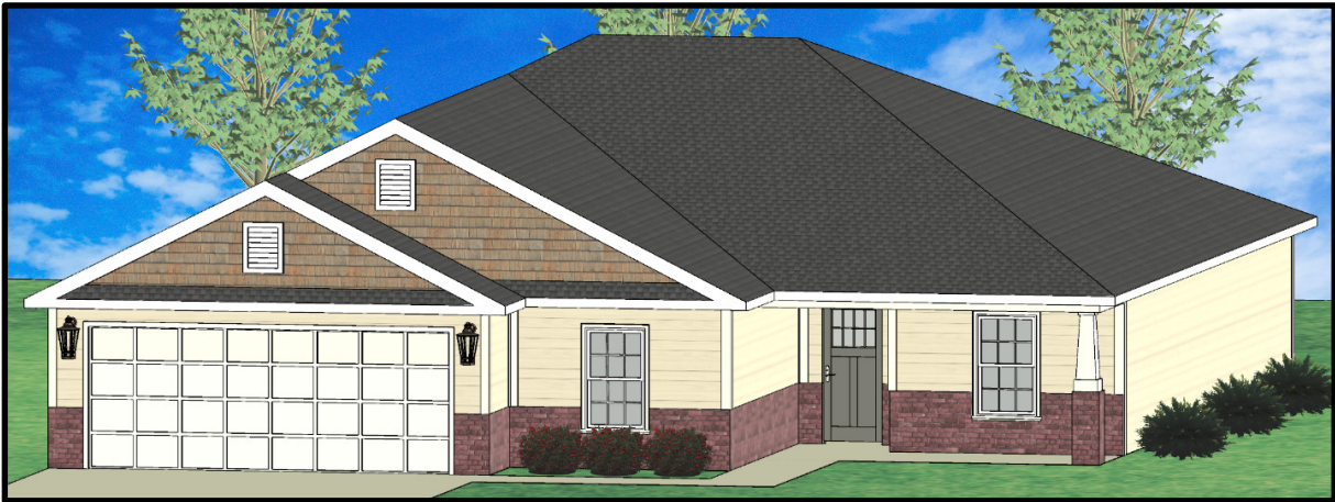
FRONT ELEVATION – OPTION “B”