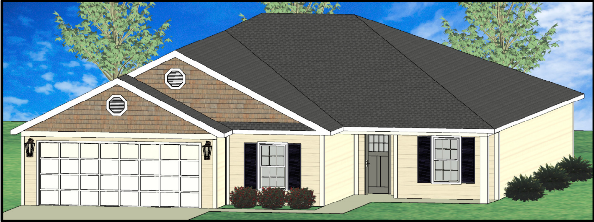
FRONT ELEVATION – OPTION “A”

OPTION A - ALL SIDING • OPTION B - WAINSCOT • OPTION C - BRICK FACE