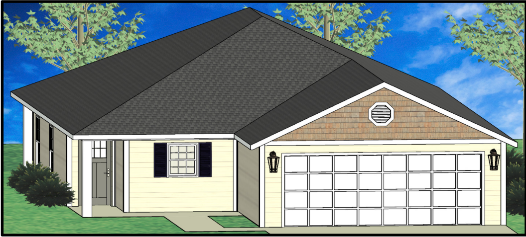
FRONT ELEVATION - OPTION "A"

OPTION A - ALL SIDING • OPTION B - WAINSCOT • OPTION C - BRICK FACE