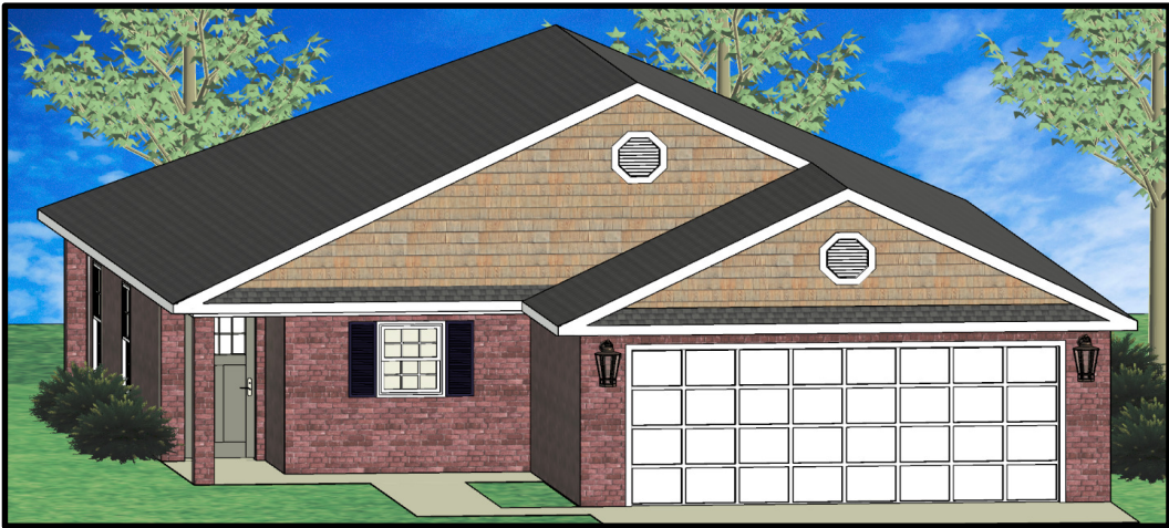
FRONT ELEVATION - OPTION "C"