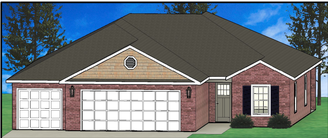
FRONT ELEVATION – OPTION “C”