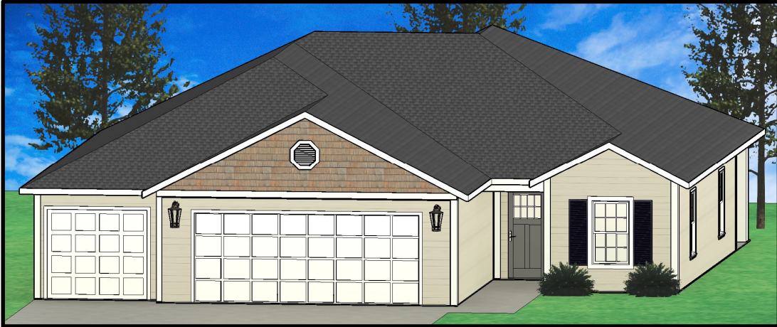
FRONT ELEVATION – OPTION “A”

OPTION A - ALL SIDING • OPTION B - WAINSCOT • OPTION C - BRICK FACE