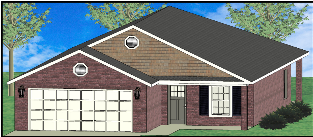
FRONT ELEVATION – OPTION “C”