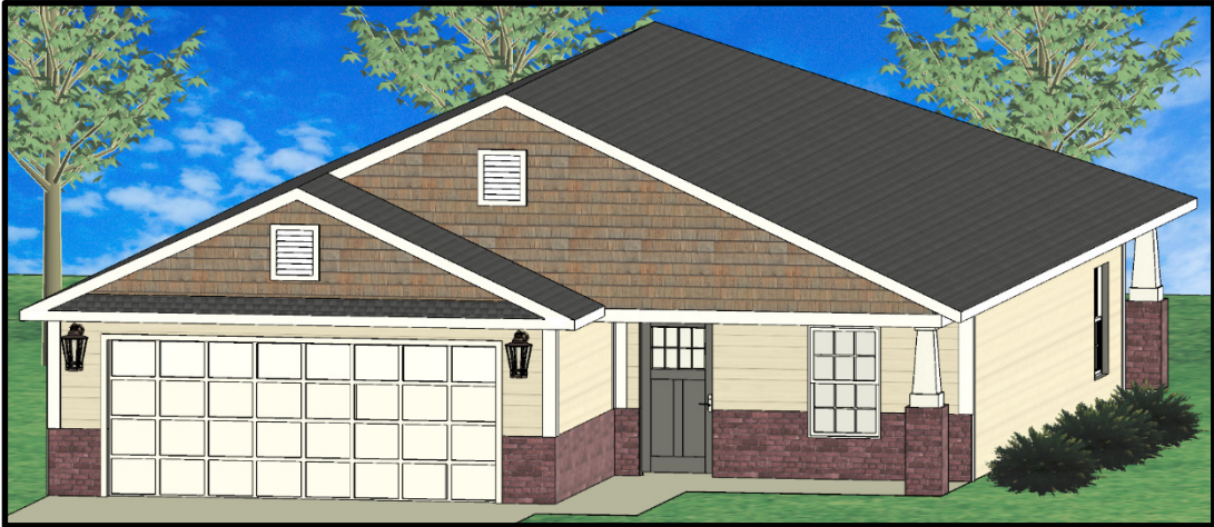
FRONT ELEVATION – OPTION “B”