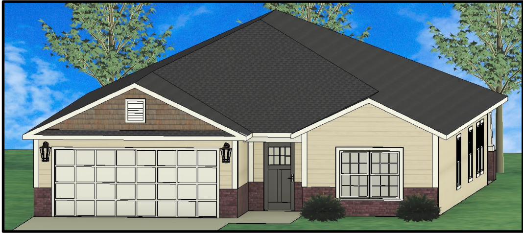
FRONT ELEVATION – OPTION “B”