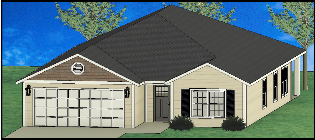
FRONT ELEVATION – OPTION “A”

OPTION A - ALL SIDING • OPTION B - WAINSCOT • OPTION C - BRICK FACE