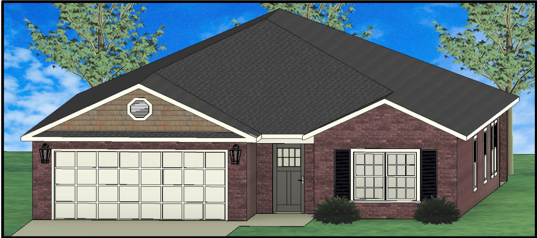
FRONT ELEVATION – OPTION “C”